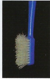
Change your toothbrush regularly