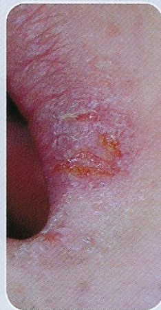
Picture showing the blisters of a cold sore