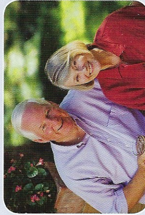
It is possible to keep your teeth for life

This stain is harmless and will show any areas of your mouth which need cleaning more carefully. Look particularly where the teeth and gums meet. Brushing again will remove the stained plaque.