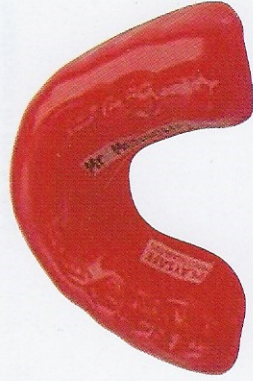
Custom-made mouthguards are the safest option