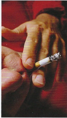
Smoking can cause many problems in the mouth

You should visit your dentist regularly, as often as they recommend. People who smoke are more likely to have stained teeth, and therefore may need appointments more often with the dental hygienist.